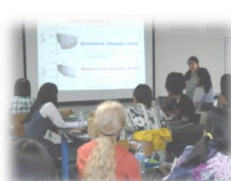
Tracy High School